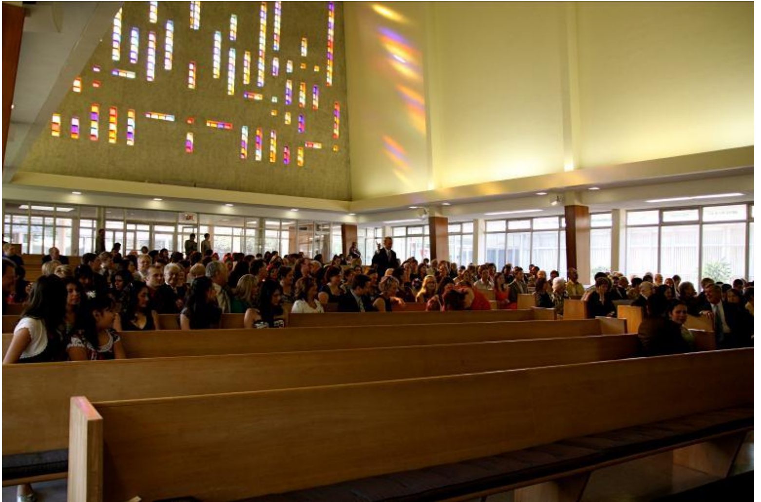
Sanctuary with guests. Front pews reserved for family of bride & groom.