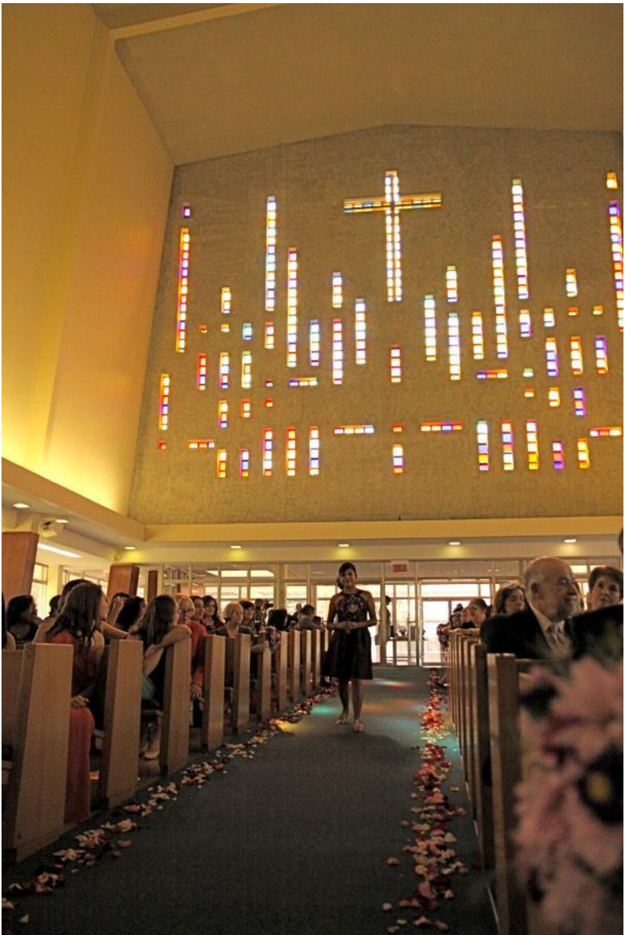
Sanctuary perspective from chancel. September late afternoon light.