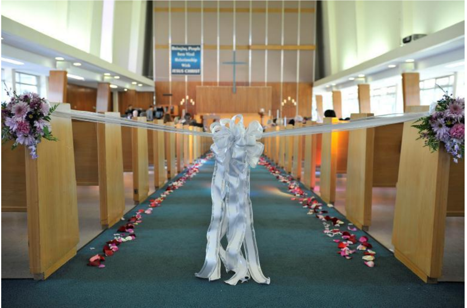
Sanctuary main aisle. September late afternoon light. Guests entered pews from outside aisles.