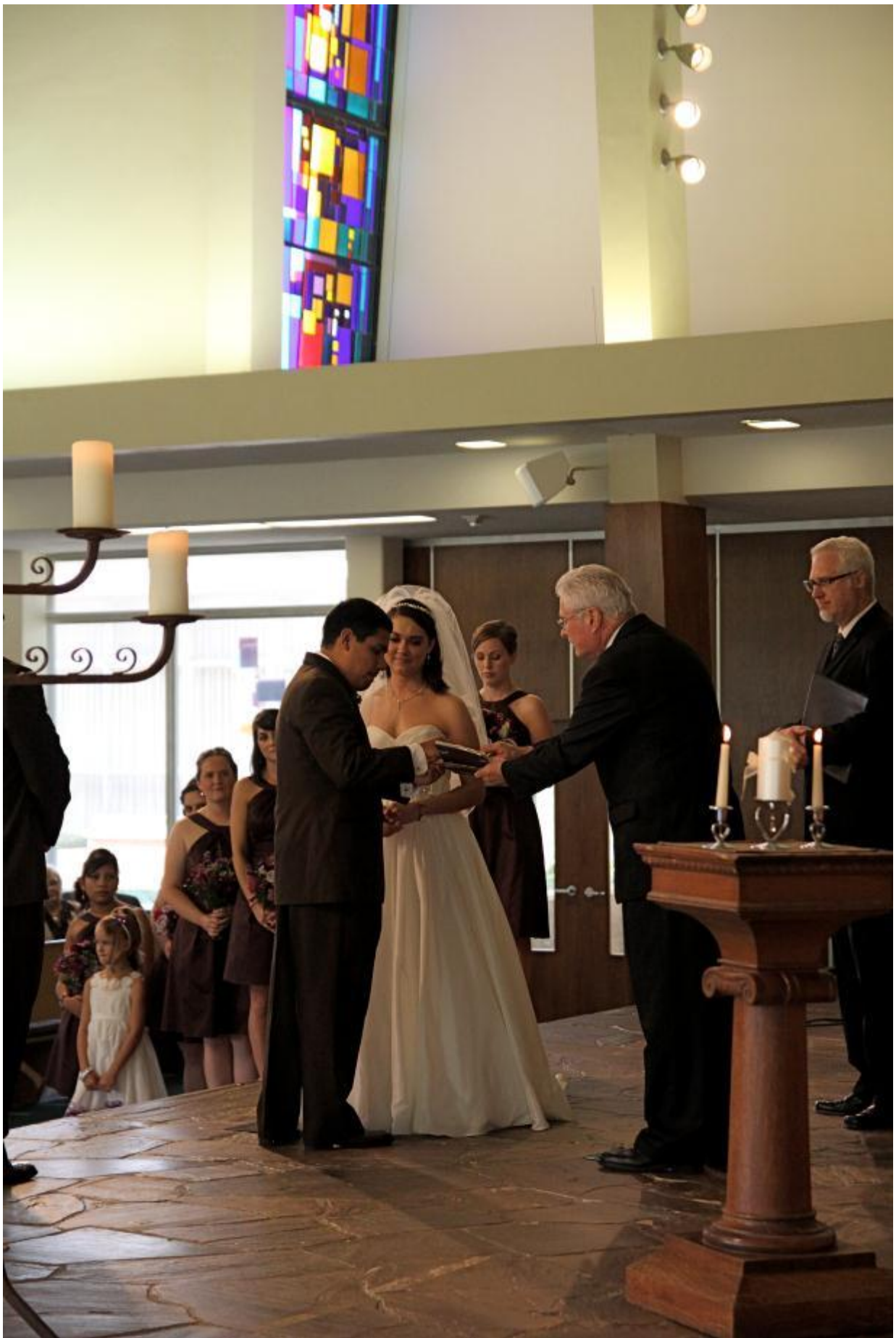
Chancel during wedding. Stand for unity candle.