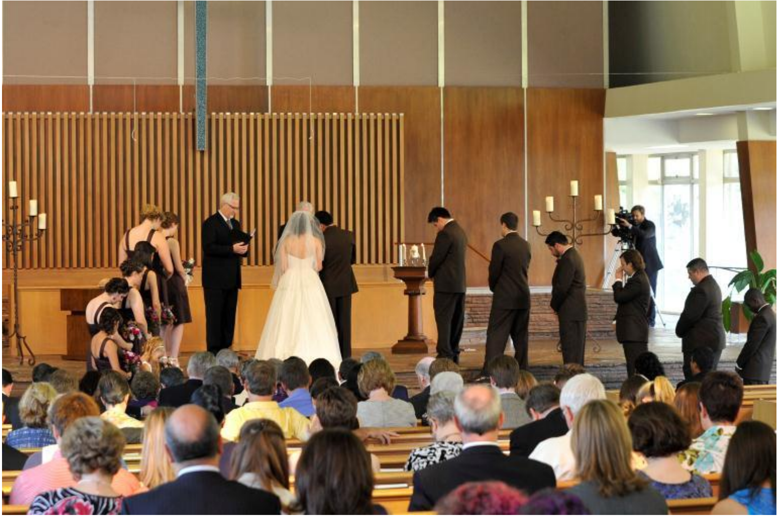
Attendants, candelabra, unity candle. Late afternoon September light.