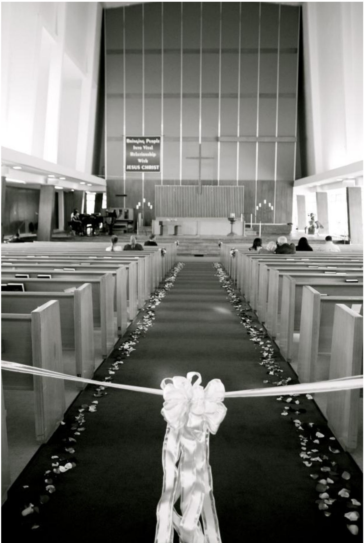
Sanctuary main aisle.